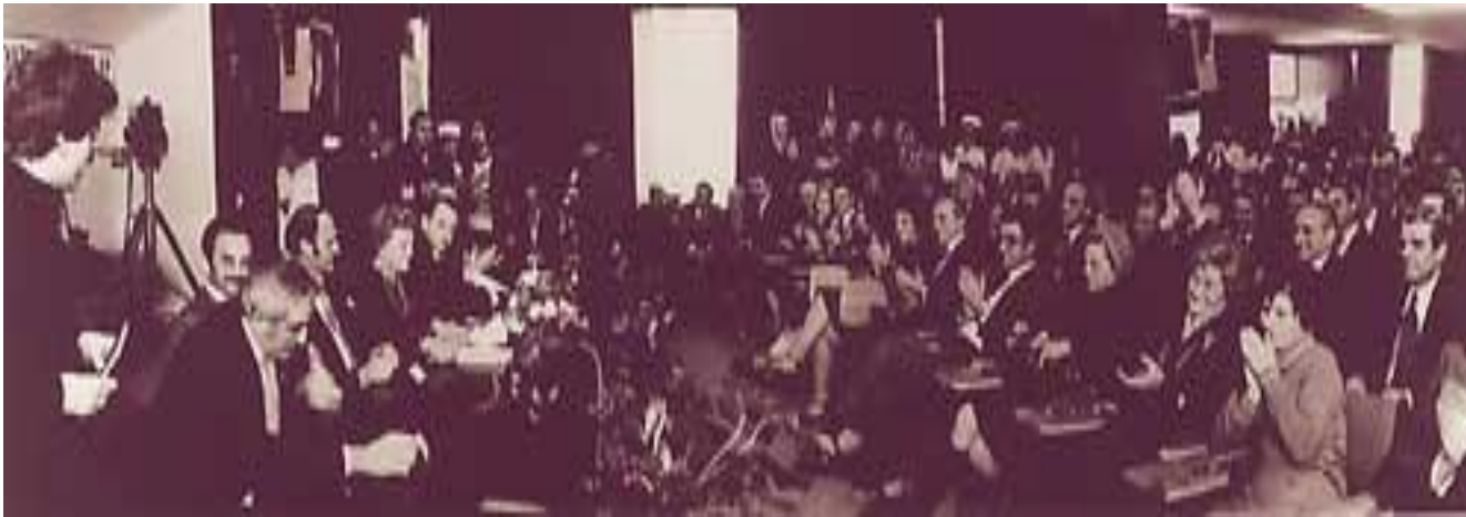
Ceremony at the opening of the Department of the Medical Faculty in Kragujevac