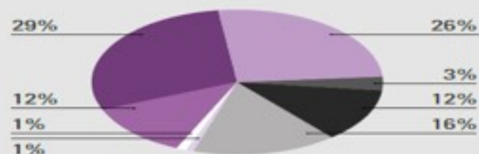
CP PER MEDICI SPECIALISTI