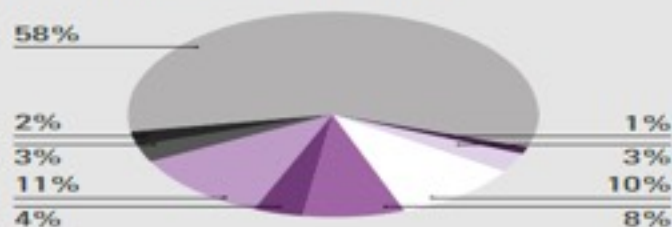
TD PER MEDICI SPECIALISTI